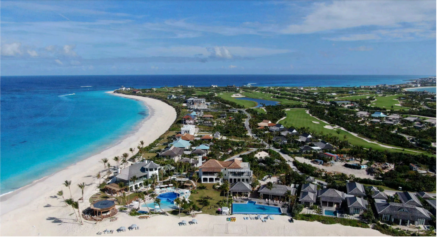
Baker's Bay, a Discovery Land community in the Bahamas. Discovery Land Company