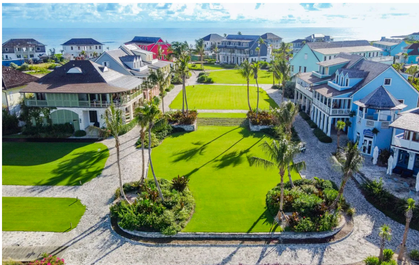
Baker's Bay Golf & Ocean Club in the Bahamas