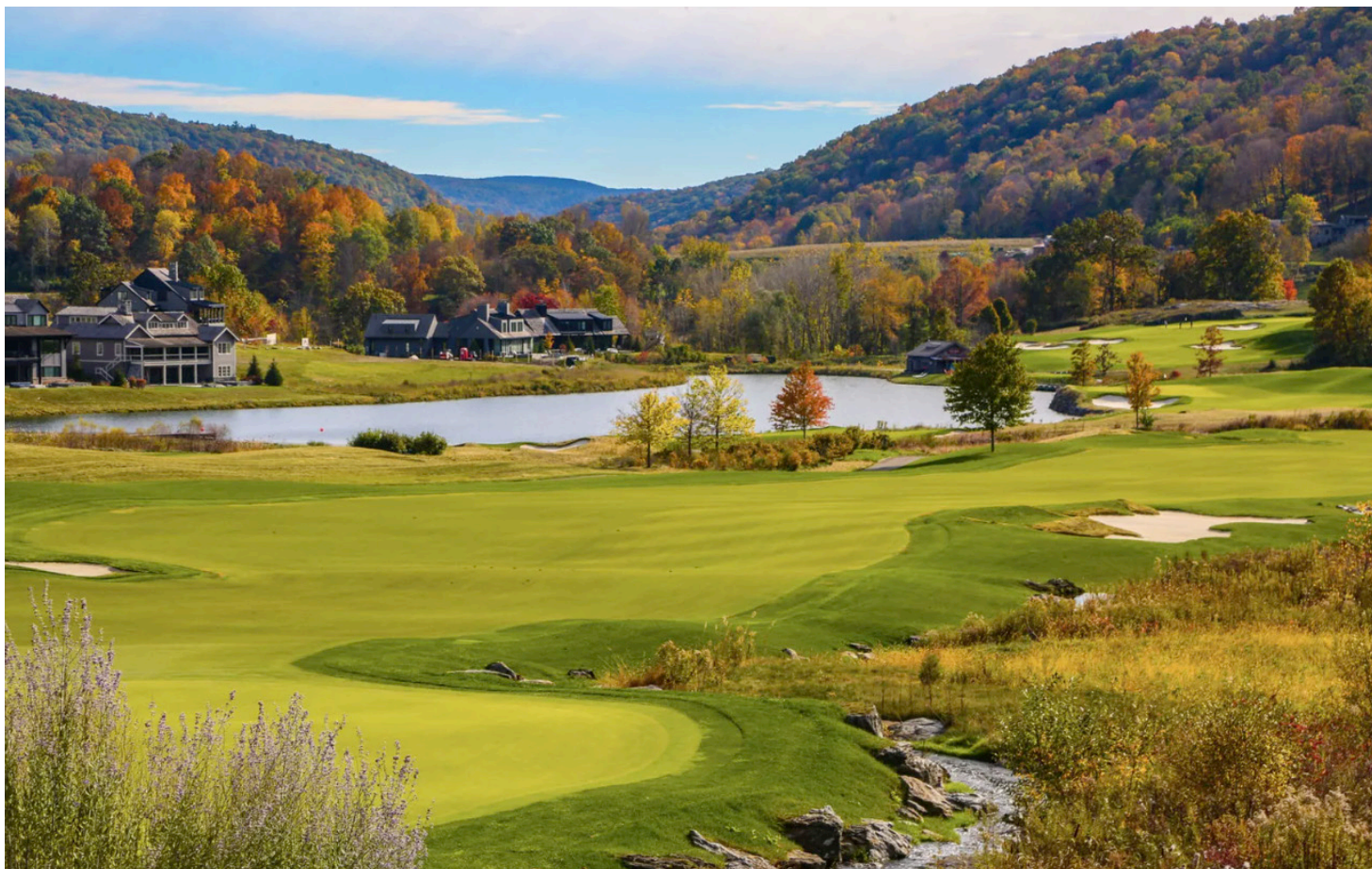
Silo Ridge Field Club in New York's Hudson Valley