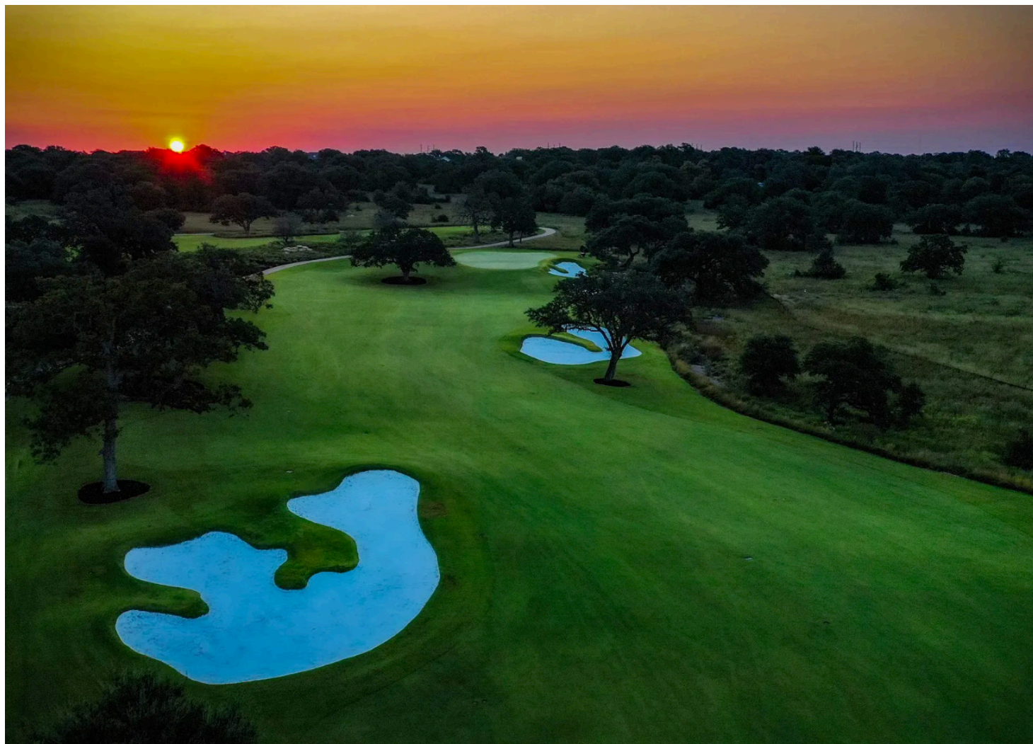
The Tom Fazio-designed golf course at Driftwood, outside of Austin